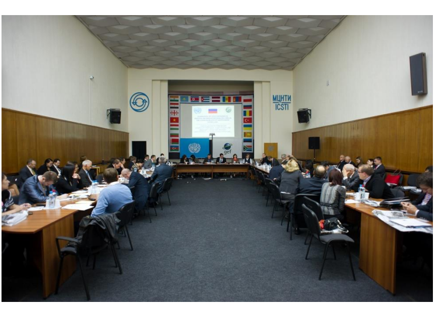
UNIDO studied more than 700 suggestions from the business